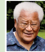
Rev. Jim Lawson Civil Rights Leader