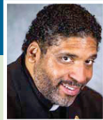
Dr. William Barber II Repairers of the Breach