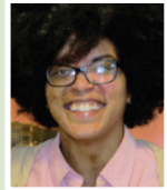
Ash-Lee Henderson Highlander Education and Research Center