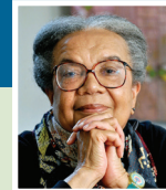
Marian Wright Edelman Children's Defense Fund