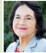
Dolores Huerta Dolores Huerta Foundation